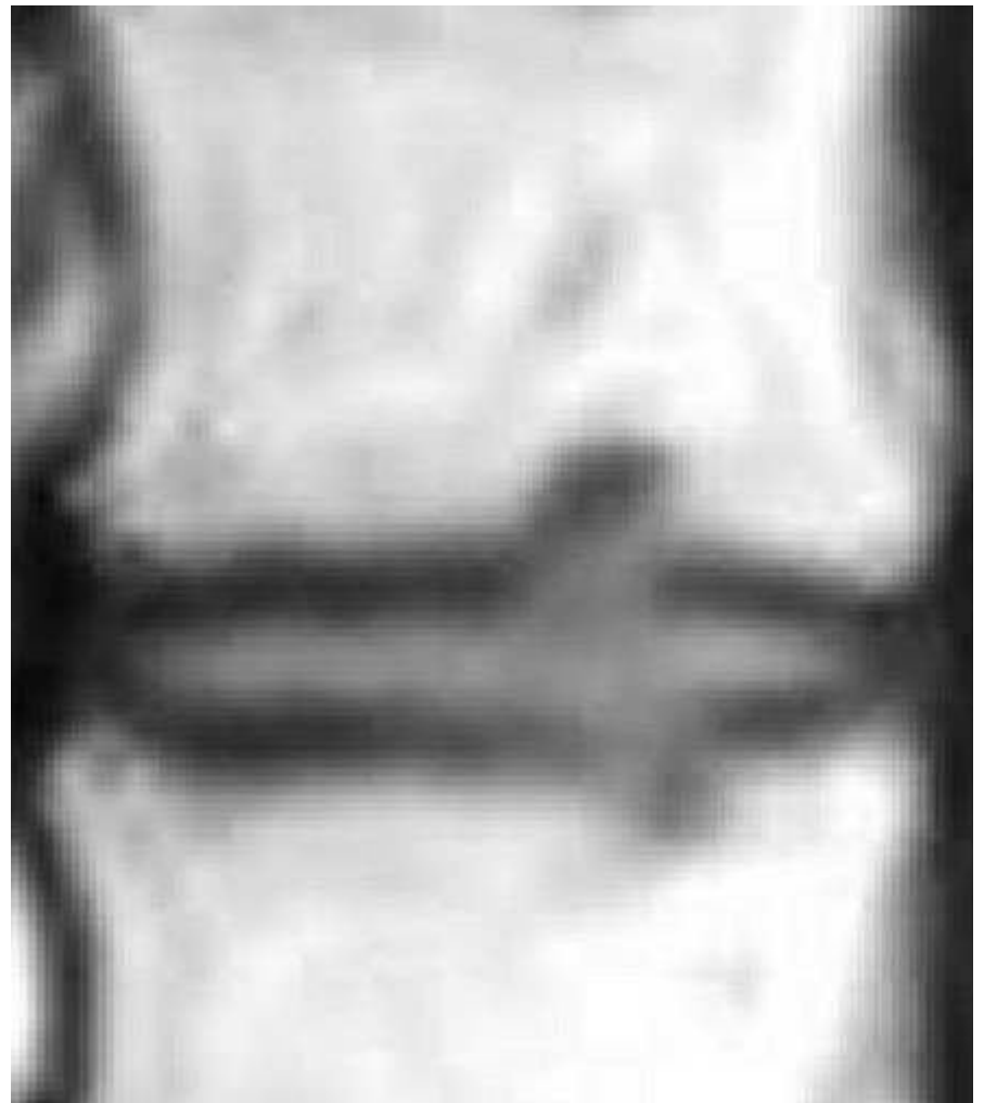
Figure 2. MRI T1 images showing vertical disc herniation (Schmorl's nodule) in the upper lumbar vertebrae.