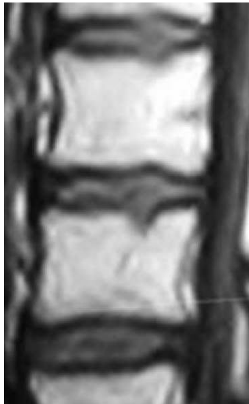
Figure 4. MRI T2 (A) and T1 (B) images showing vertical disc herniation (Schmorl's nodule) in the upper lumbar vertebrae